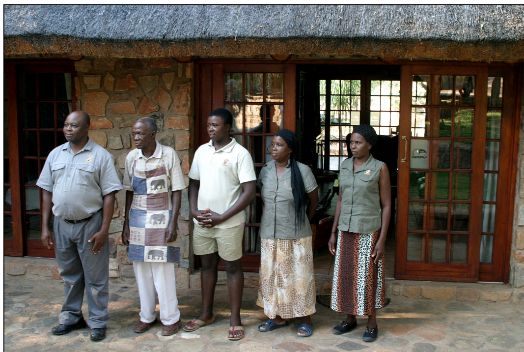
The friendly and helpful staff at Riverview, February 2011.

Birdnames: Sinclair, Hockey & Tarboton (2002): Birds of Southern Africa (Third edition).