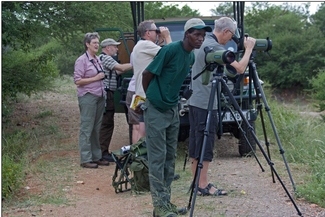
Limpopo Hippodam, February 2011.